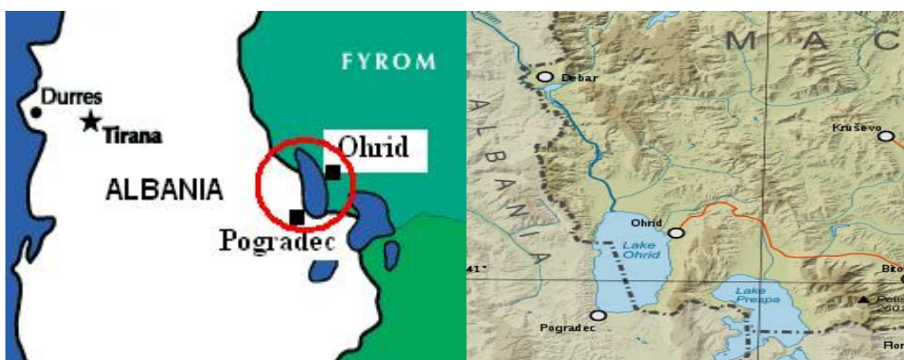
Fig.1. Map of study Lake Ohrid Ecosystem